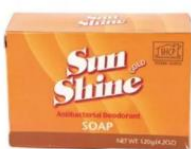
Two bath-size bars