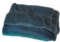
One light-weight bath-size towel