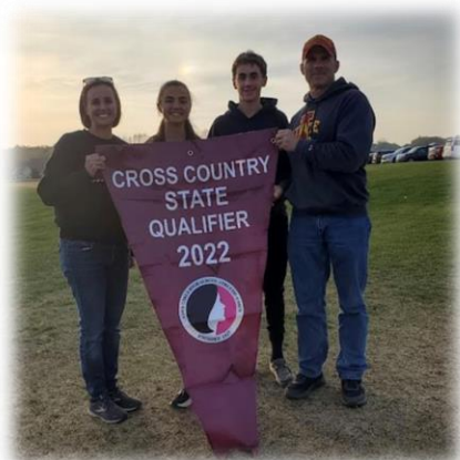
The Landis Family