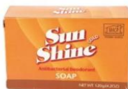
Two bath-size bars